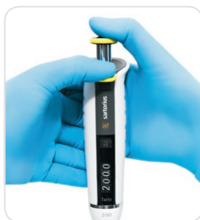
Built-in filter ejector in Tacta®

When Should You Use them? The ultimate pipette protectors are available in two types: